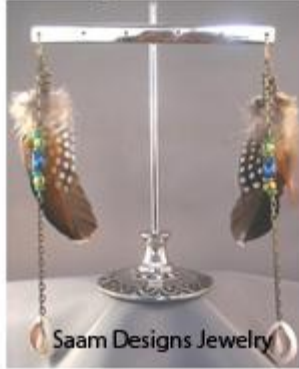
Saam Designs Jewelry