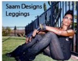
Saam Designs Leggings