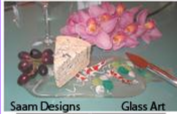
Saam Designs Glass Art