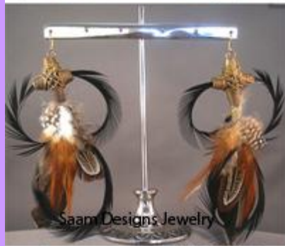
Saam Designs Jewelry