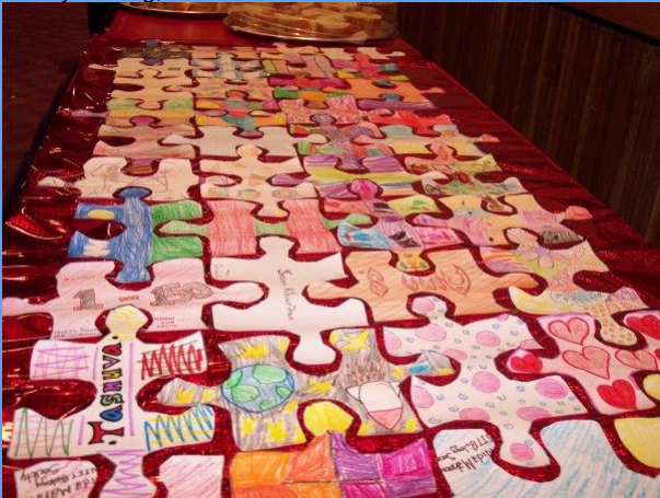
Photo: Original Autism Quilt stretched 6ft by 5ft long, taken March 2008.

INFO: We create Autism Quilts and distribute them to participating schools as gifts. We believe that by having quilts hung at various institutions, we will be able to bring awareness of Autism. It fulfills our organization's 'motto', We captivate to educate.