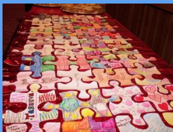
Photo Info: This is the photo of the original Autism puzzle piece portrait that stretched from 6x5 feet long. We're currently trying to reformat the entire piece.

Next meeting discussion : 3/06/2010 (See MENU column of this Newsletter for more information)